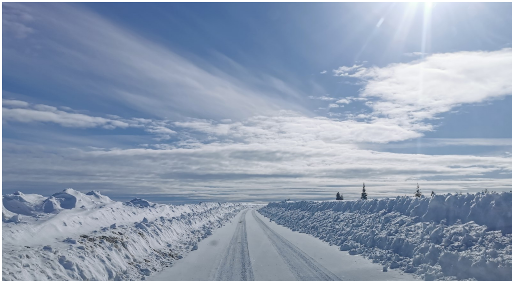
Wolverine Mine Access Road