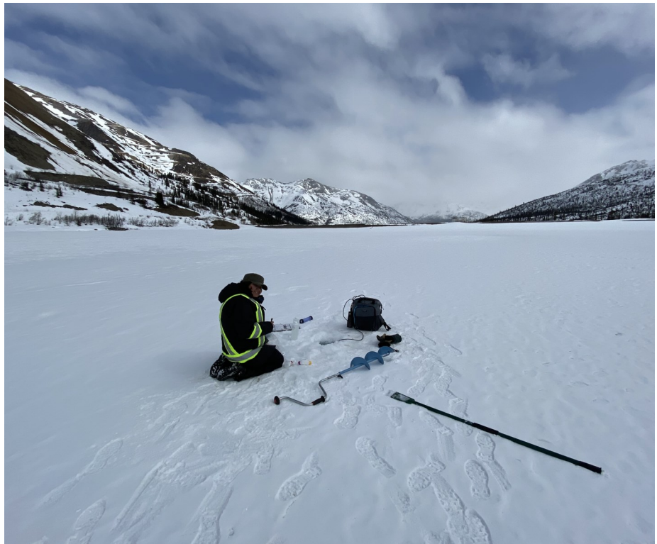
Jody Inkster collecting a water sample at the Ketz River Mine (April 2021).

"We aren't actually miners, as First Nations people. We are land stewards. We take care of the land, animals. We're one with the land".