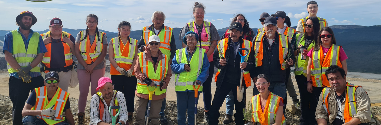
Most of the tree planting crew at the Land Cover Pilot Project, June 20, 2023.