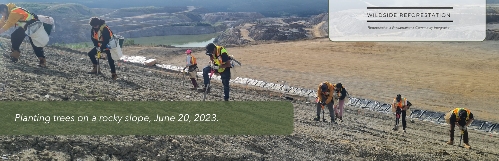
Planting trees on a rocky slope, June 20, 2023.

Reforestation x Reclamation x Community Integration